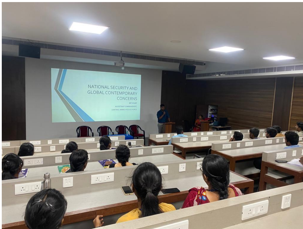
Students attending the session