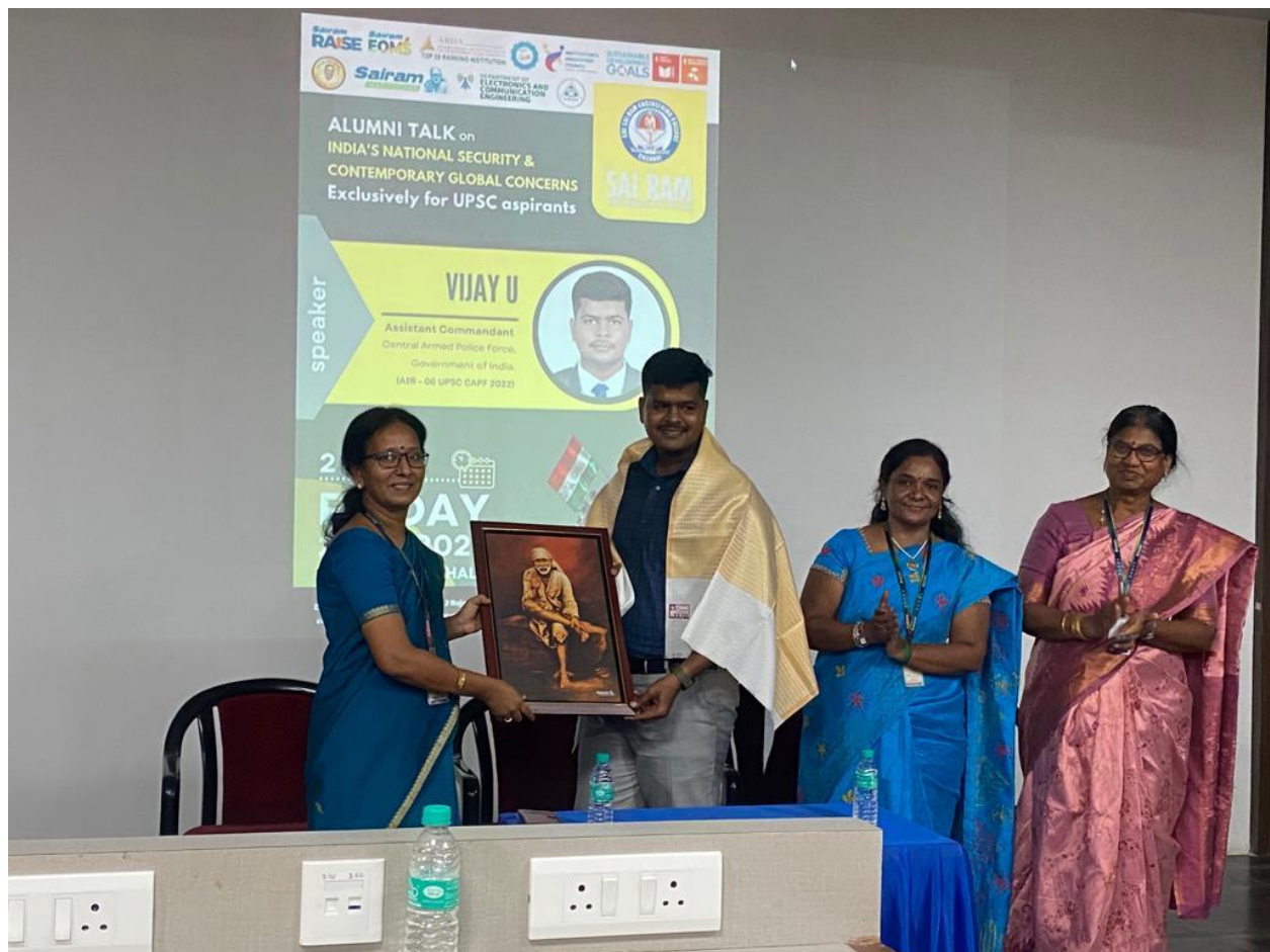
Honouring the Guest

Below some of the pictures that depicts the event.